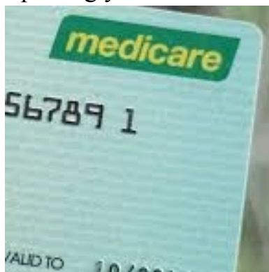
New Medicare card coming in April 2018.

This is important to understand because Medicare is replacing your Medicare card with a new Medicare