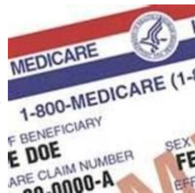
Old Medicare card being replaced in 2018.

Just remember, RSVP's SHIP volunteers are here to help. When in doubt, just say "No"...and then call SHIP! Trained, certified SHIP volunteers will help you understand your Medicare benefits and let you know about current scams.